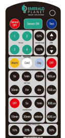
Sensor & Sensor Remote Control